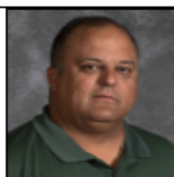
Ed Freije Cathedral – 4A